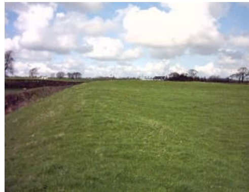
The North-West Corner Angle is the highest standing point

Cohors Primae Nerviorum Germanorum milliaria equitata