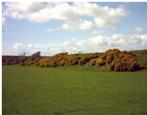
The Southern Rampart viewed from the Burn

The only classical reference for the name of the Birrens encampment is contained in the Antonine Itinerary of the late-second century. Iter II , the route from the Entrenchments to the port of Rutupiae , four-hundred and eighty-one thousand paces, details the journey from Hadrian's Wall to Richborough in Kent. In this itinerary the name Blato bulgio appears as the northern terminus , some 12 Roman miles from Castra Exploratorum (Netherby, Cumbria), both stations lying beyond the Wall of Hadrian.