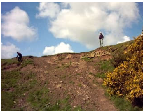
The South-East Corner Angle showing Roman masonry exposed by erosion