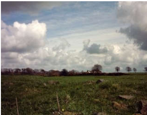
The Western Gateway looking towards the interior

There is one particular stone recovered from Birrens which is extremely interesting as it appears to contain the names of two legionary units not normally found in Britain ( vide supra ); the Eighth Augustan Legion is thought to have accompanied the emperor Claudius to Britain during the initial invasion in 43AD and was presumed to have returned to Rome in the emperor's train after spending a little over two weeks in the island, they are also mentioned on a military diploma? (RIB 2426.1; not available); the movements of the Twenty-Second Legion Primigenia in Britain are almost completely unknown, there being only one other stone bearing the name of this unit ( vide RIB 2216 ), found somewhere in Scotland, which ain't very helpful.