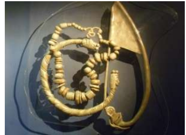
The Vanannan Purt Ny h-Inshey, Mannin

The Southern Isles (Suðreyjar) experienced changes in power and control during the 9th to 13th centuries AD. There were significant periods of independent rule and times when there were overlords in Norway, Scotland, Ireland and Orkney. Perhaps the most famous Norse legacy is the Isle of Man's Parliament, Tynwald. The name is derived from the Norse 'Thingvalla' which means 'Assembly Place'. The Manx have retained the system of government introduced by the Norse. The Manx Parliament of Tynwald is the oldest continuous parliament in the world and there were other such assembly sites in Scandinavia.