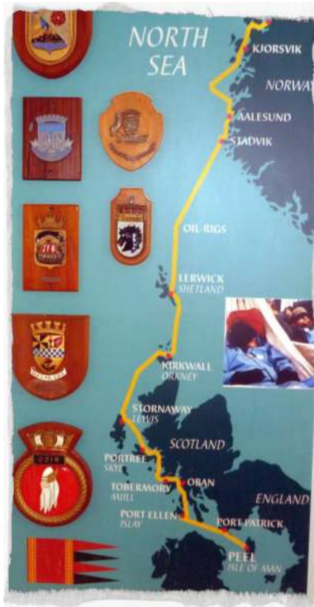
Route of re-enacted Viking voyage

Hårfagre took control of the Islands in 875 AD and they became an earldom. They were ruled as a province of Norway and under the Jarl (Earl) during the Earldom of Orkney (rule also extended into parts of Caithness and Sutherland). King Christian I pledged the Islands as security for the dowry of his daughter Margaret of Norway who became Queen Margaret of Scotland (1469 to 1486) upon her marriage to James III of Scotland. The dowry not being paid the islands became part of the Kingdom of Scotland in 1471. Norwegian law was not abolished in Shetland until 1611 and the Norse based language of Norn continued in common use for over two centuries after that.