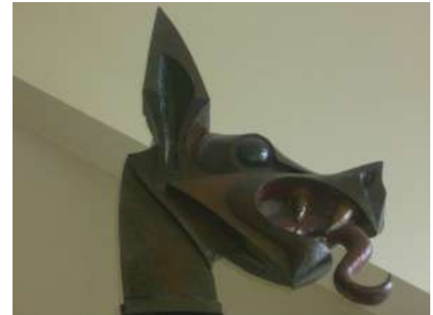
Viking boathead carving

At the time of the Norse Kings the Isle of Man was the centre of the significant Kingdom of Mann and the Isles. These Southern Isles (Suðreyjar) were ruled by a Tynwald which had 32 members, with 16 from the Isle of Man and 16 from the Isles of Skye, Mull and Lewis. In the twelfth century Argyll took control of Mull and Islay and with the loss of their eight assembly members Tynwald was reduced in size from 32 to 24.