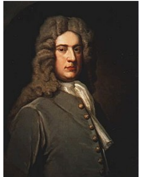
Col. Richard Lee (1618–1664), the "Immigrant"