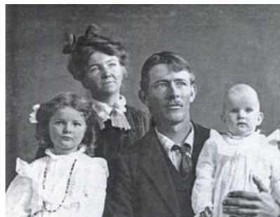
Added by: Chloe Perdeu

Birth: Sep. 1, 1901 Monterey County California, USA Death: Jul. 18, 1987 Monterey County California, USA