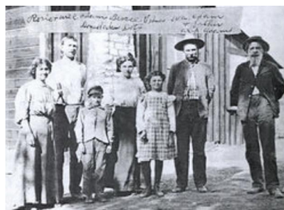
Added by: Chloe Perdeu