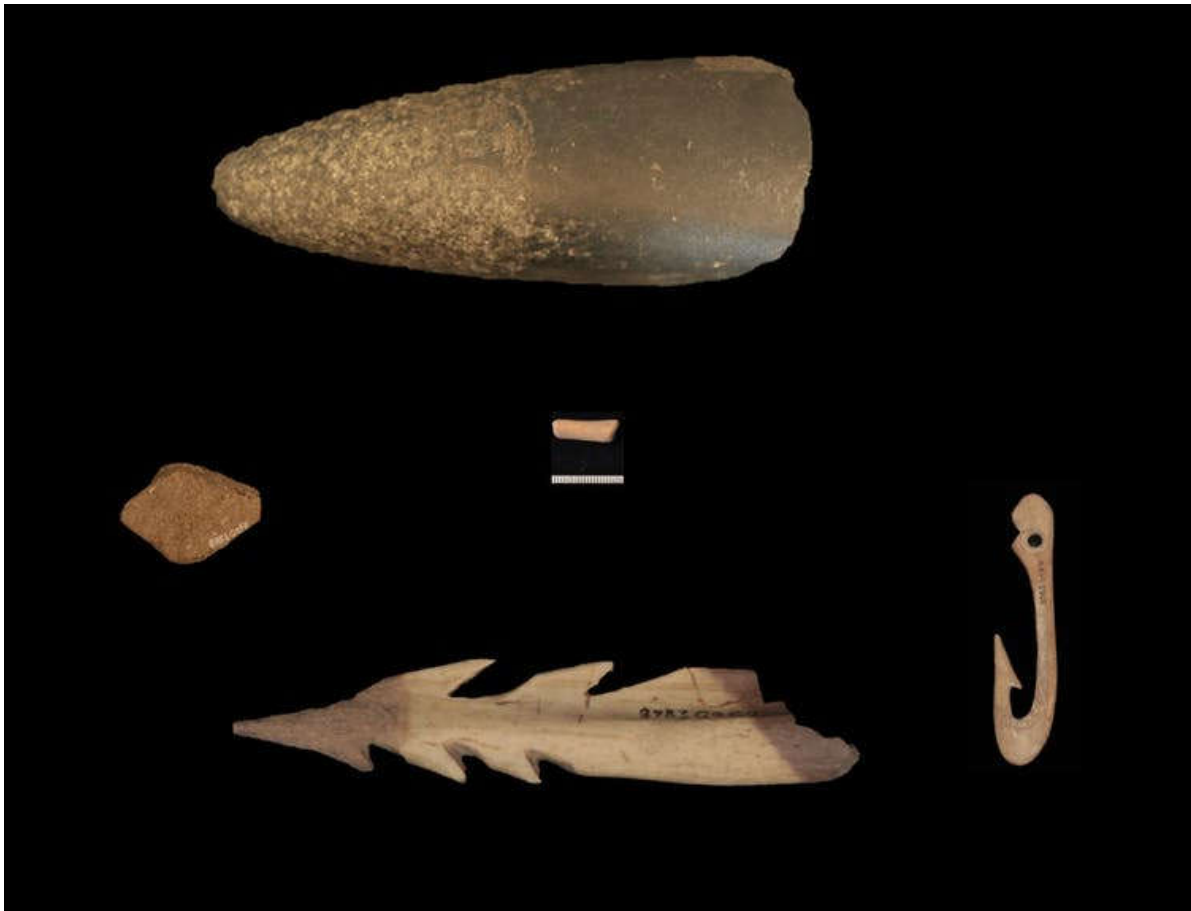
Axe, fish hook and other stone tools from the earliest Scandinavians, found in a cave on Gotland.

Knowing the genomes of these hunter gatherer groups also allowed us to look deeper into the population dynamics in stone age Scandinavia. One consequence of the two groups mixing was a surprisingly large number of genetic variants in Scandinavian hunter gatherers. These groups were genetically more diverse than the groups that lived in central, western and southern Europe at the same time. That is in stark contrast to the pattern we see today where more genetic variation is found in southern Europe and less in the north.