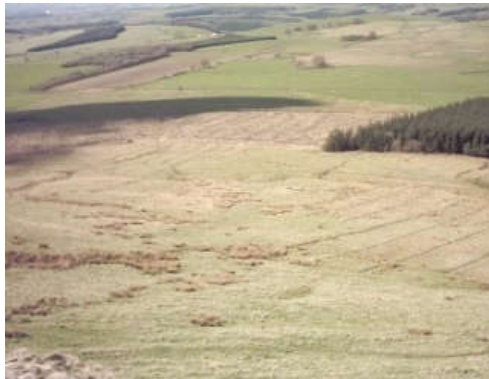
The Northern Training Camp viewed from the hillfort