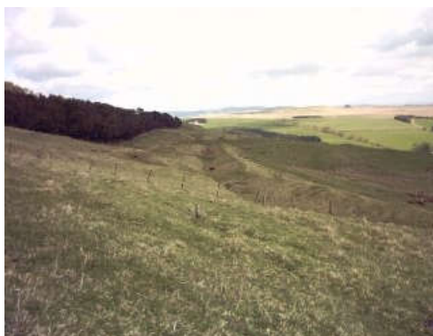
The Ballista Platforms in the south camp's north defences

A Probable Roman Slingstone from Burnswark found in a rabbit-warren on the southern hillside (note the damage caused by a high-velocity impact)