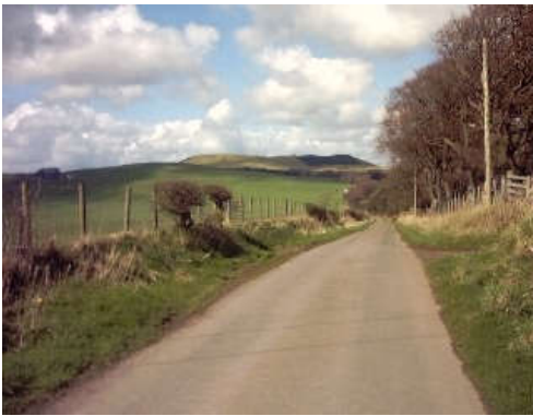
The Burnswark Hillfort from the approach-road to the south

The native hill fort dominates the area for miles around, and was possibly the site of a siege during the early conquest of Scotland, with large marching camps built on both the north and south sides, that on the south later turned into a training camp where Roman soldiers would be sent to learn artillery skills. Three ballista platforms dominate the northern ramparts of the south camp, whose western defences partly overlie a known Antonine fortlet, now hidden within a plantation of trees. The ballista A prominent outcrop on the south side of the British camp was evidently used as a target during Roman times as several examples of leaden sling-shot have been recovered from this area during excavation.