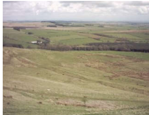
The Southern Training Camp viewed from the hillfort

The possibility that Burnswark was primarily a training camp is supported by the fact that there are two practice works nearby, situated to either side of the Burnswark hillfort. These training earthworks were very likely erected under the supervision of Roman engineers in order to teach troops the basics of entrenchment. The rampart of the southern training camp partly overlies the defensive ditch of the Antonine fortlet which occupied its north-eastern corner, and silting evidence suggests that the earlier earthwork had been abandoned for some considerable time. All of the pottery recovered from the site dates to the second century. Traces of permanent structures within the southern encampment suggest that the site continued in use until the early-third century.