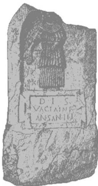
Tombstone of Vacia