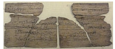
Vindolanda tablet 291

The Vindolanda site museum, also known as Chesterholm Museum conserves and displays finds from the site. The museum is set in gardens, which include full-sized reconstructions of a Roman temple , a Roman shop, Roman house and Northumbrian croft, all with audio presentations. Exhibits include Roman boots, shoes, armour, jewellery and coins, infrared photographs of the writing tablets and, from 2011, a small selection of the tablets themselves, on loan from the British Museum. 2011 saw the reopening of the museum at Vindolanda, and also the Roman Army Museum at Magnae Carvetiorum , refurbished with a grant from the Heritage Lottery Fund. [17]