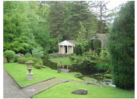
Gardens outside the museum

In 1970, the Vindolanda Trust, a registered charity , [18] was founded to administer the site and its museum, and in 1997, the Trust took over the running of the Roman Army Museum at Carvoran , another Hadrian's Wall fort, which it had acquired in 1972.