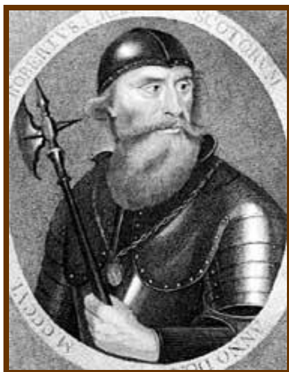
Robert the Bruce King of Scots

Robert the Bruce King of Scots 4 born 11 July 1274 in Writtle, Chelmsford, Essex, England, died 7 June 1329, was the son of Robert de Brus 6th Lord of Annandale and Marjorie of Carrick . They had a daughter, By this marriage he acquired the manors of Writtle and Hatfield Broadoak, Essex in England. He married, secondly, Lady Elizabeth de Burgh , daughter of Richard de Burgh, 2nd Earl of Ulster and Margaret de Burgh , in 1302.