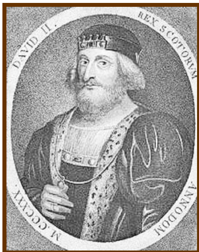
David II, King of Scotland

David II Bruce, King of Scotland 11 was born on 5 March 1323/24 at Dunfermline Palace, Dunfermline, Fife, Scotland, the son of Robert I Bruce, King of Scotland and Lady Elizabeth de Burgh. He married, first, Joanna 'of the Tower' Plantagenet, daughter of Edward II, King of England and Isabelle de France, on 17 July 1328 at Berwick-upon-Tweed, Northumberland, England. He married, secondly, Margaret Drummond, daughter of Sir Malcolm Drummond, 10th Thane of Lennox and Margaret de Graham, on 20 February 1363/64 at Inchmurdach Manor, Fife, Scotland. He and Margaret Drummond were divorced circa 20 March 1370.