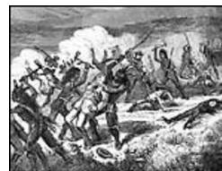
Depiction of Mountain Meadows massacre.

worrisome, the emigrants had seen that Mormons were involved in the assault, and this would undercut any later claims that the attack had been solely the work of Indians. Lee and his followers decided to kill anyone old enough to testify, and then they set a trap. Lee's men offered the surrounded settlers safe passage out, then when the Arkansans agreed, the Mormons slaughtered every man, woman, and child over the age of seven, some 120 in all. The militiamen then took a vow of silence, and the cover-up began. The assault would be blamed entirely on the Paiutes, and the truth would be concealed throughout the church hierarchy. Brigham Young himself would play a part.